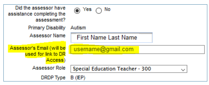
Figure 2. SIRAS Systems Data Entry Screen